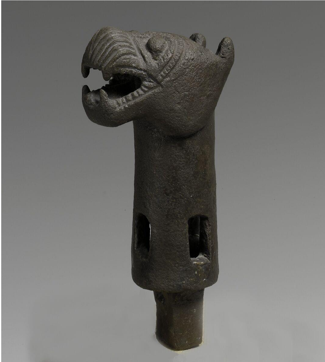
"Lion's Head Terminal", Iran circa 9th century BCE ( https://www.metmuseum.org/art/collection/search/325608 )