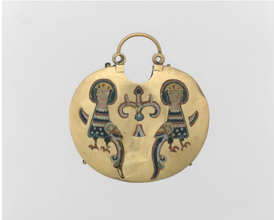
" Temple Pendant with Two Sirens Flanking a Tree of Life ", Kyivan Rus' 11th–12th century ( https://www.metmuseum.org/art/collection/search/464554 )