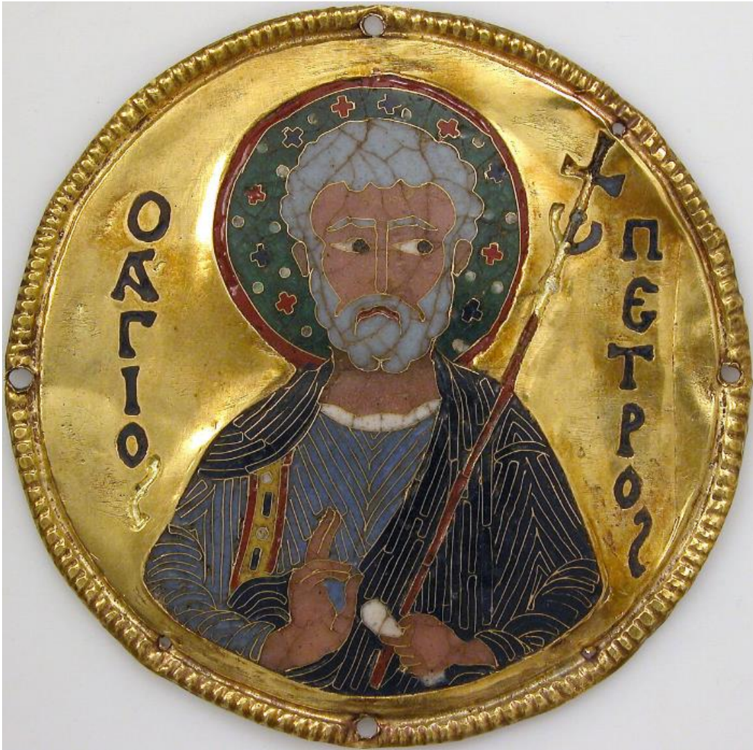
Medallion of St Peter from an icon frame– Byzantine 1100 ( https://www.metmuseum.org/art/collection/search/464543 )