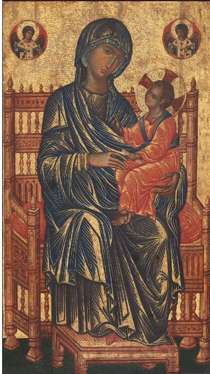
Madonna and Child – Byzantine 13th Century (possibly from Constantinople)