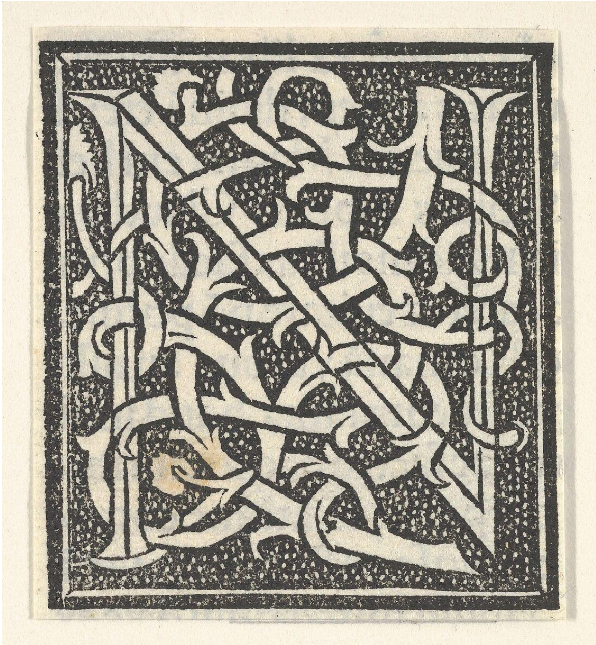
Initial letter N on patterned background – Italian1520 ( https://www.metmuseum.org/art/collection/search/700387 )